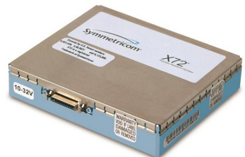
The X72 rubidium atomic oscillator

The X72 provides highly precise outputs using the inherent stability of the rubidium atom, in a compact form factor. This delivers an excellent value to the market for a wide range of applications.